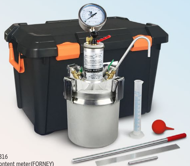
LA-0316 Air content meter(FORNEY)