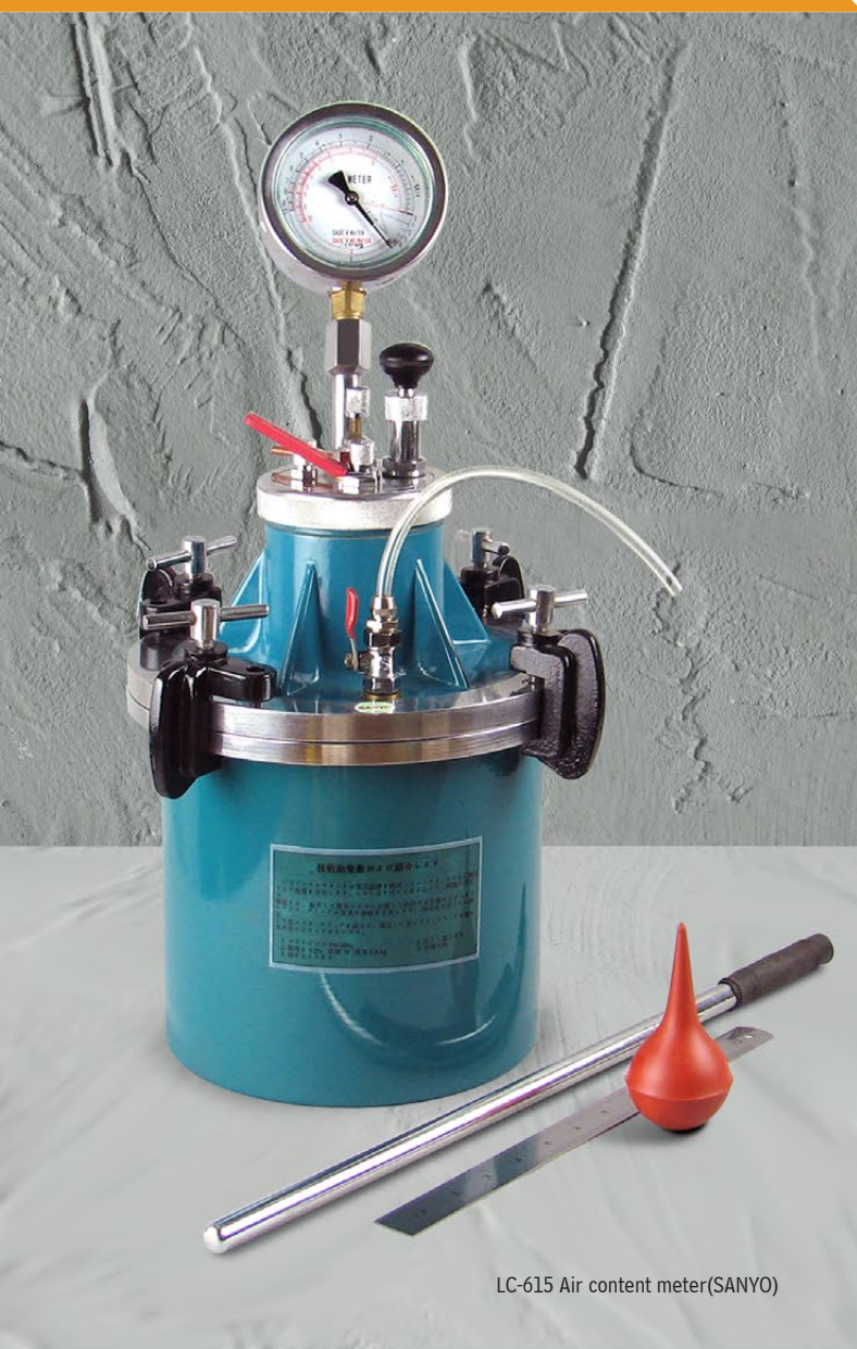
LC-615 Air content meter(SANYO)