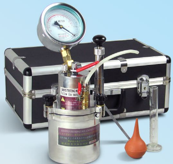
LS-546 Air content meter